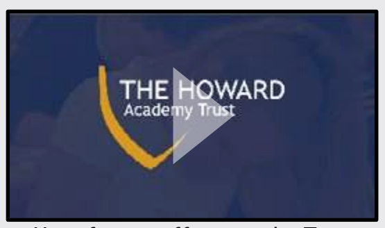
Hear from staff across the Trust