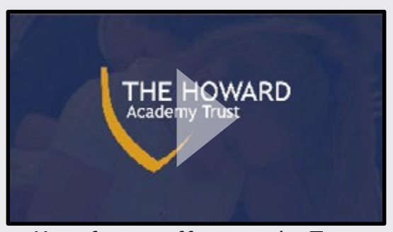
Hear from staff across the Trust